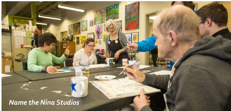
Name the Nina Studios