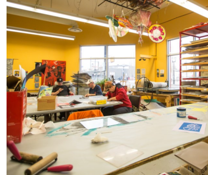
There are five busy studios at the Nina with more than 4,500 square feet of bright well-equipped space used by more than 200 people every week.

As we re-focus our energies and explore opportunities to work with the Social Enterprise Fund to expand our fund development capacity, we are seeking a community partner interested in making a significant contribution. In exchange, we offer a legacy project - your name, in perpetuity, on our facility, alongside the Stollery Gallery. The sponsorship value for naming (recognized with prominent external and internal signage), is $250,000. We would propose that this amount be paid in annual installments over the next 5 to 10 years. Anyone with thoughts or ideas on this topic are encouraged to contact Wendy Hollo or Rona Fraser.