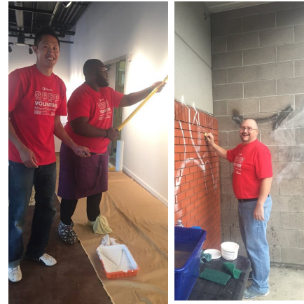
Stantec employees celebrated Stantec in the Community Day at the Nina, giving the gallery a fresh coat of paint and removing some that defaced our exterior walls...

A project like this would not have been possible without the generous support of Stantec and a grant from the Edmonton Arts Council.