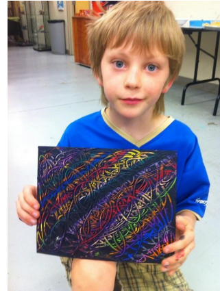
Community and Family Art Nights, Saturday CASA program, Crystal Kids and Nina Art Nights (our own special brand of "Paint Night"), are in full swing.

Last, but certainly not least, the Nina offers a series of "Art Nights." For a fee, participants enjoy wine and appies while creating their own masterpiece. Each session is inspired by a piece of art created by an artist in the Nina studio Collective.