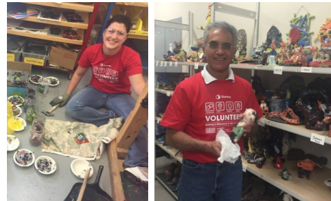
...The Nina studios were thoroughly cleaned...event the kitchen sparkled!