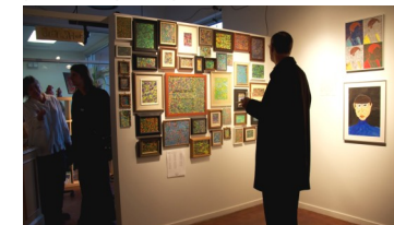
Wall of art by Ulrike Rossier