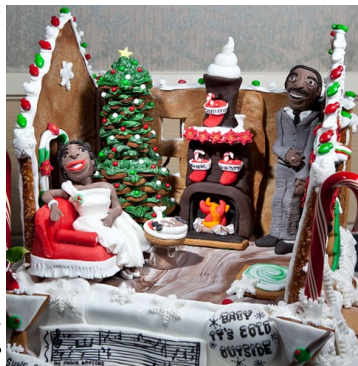
Cheryl's Creations (for CPI Construction) - 3rd Place