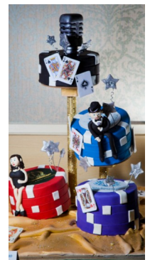
Whimsical Cake Studio