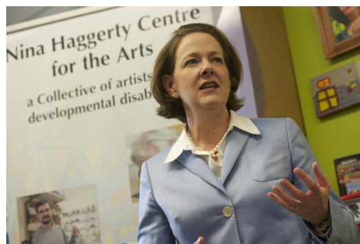
Premier Alison Redford

It was a tremendous honour to meet the Premier in such an intimate atmosphere and definitely a night to remember! Check out our photo gallery inside this edition of the Nina News.