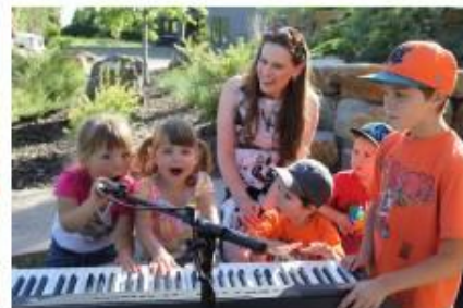
It was a family affair