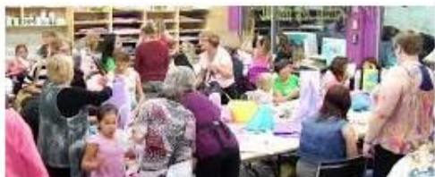
Be sure to come to The Nina Friday evening (Sep 12) to make a lantern to carry in the lantern parade.