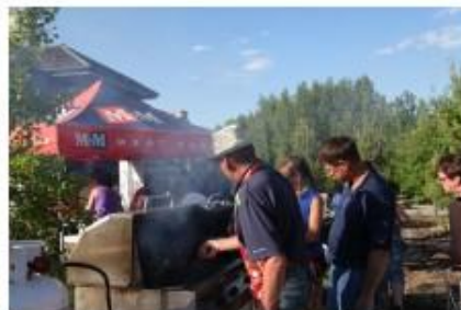
BBQ by M&M Meats Hermitage location