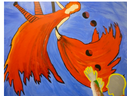
Four mural panels are now almost complete and will be installed on the exterior east wall of the ArtsHub 118 building that houses the Nina Haggerty Centre.