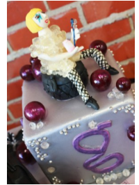
(Top left) In 2nd Place was this creation by Bugato Custom Cake Design and in 3rd Place (top right) was Whimsical Cake Studio.