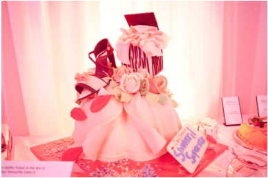
The Art of Cake took 1st Place for 3rd Year!