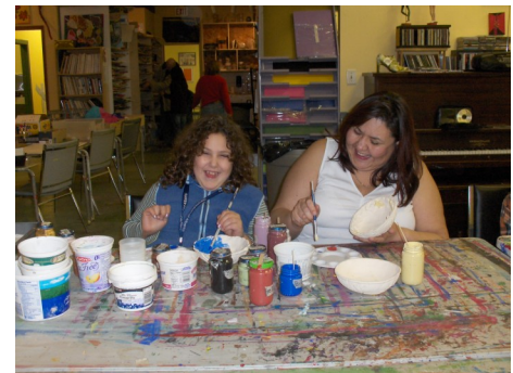
Family Art Night is a great way for families to enjoy creative time together.

The Edmonton Community Adult Learning Association has made a commitment to support the Centre's community outreach programs. Each Tuesday and Thursday evening, free and low cost art classes are offered to area residents. One evening is open to adults and the other to families with school aged children. Everyone is welcome - just call the Centre to register!