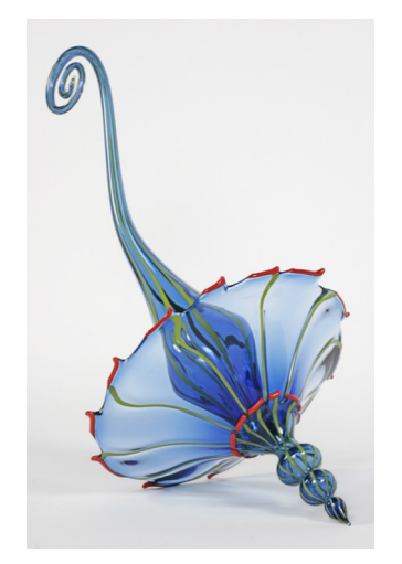
Keith Walker is a talented glass blower. His studio, Blow in the Dark Glassworks is located near the Centre.

To expand the experience of working with glass to the Collective (now more than 150 artists), the project includes purchase of a specialized kiln for fusing and slumping glass. This art form is highly accessible and will be offered to all interested artists. The Centre also plans to expand its community outreach programming to include glass workshops. Watch for an exhibition in July.