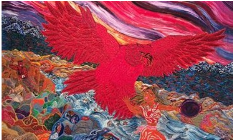
Justin Berger's Exhibit Kulu a "Signature Moment" in 2014